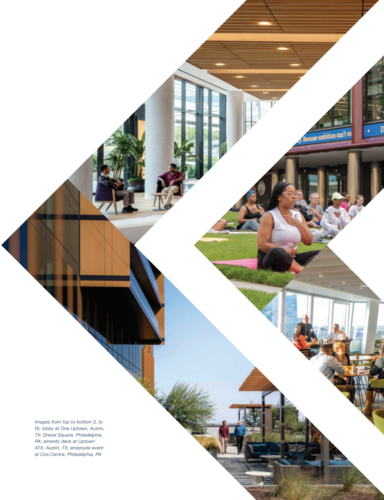
Images from top to bottom (L to R): lobby at One Uptown, Austin, TX; Drexel Square, Philadelphia, PA; amenity deck at Uptown ATX, Austin, TX; employee event at Cira Centre, Philadelphia, PA