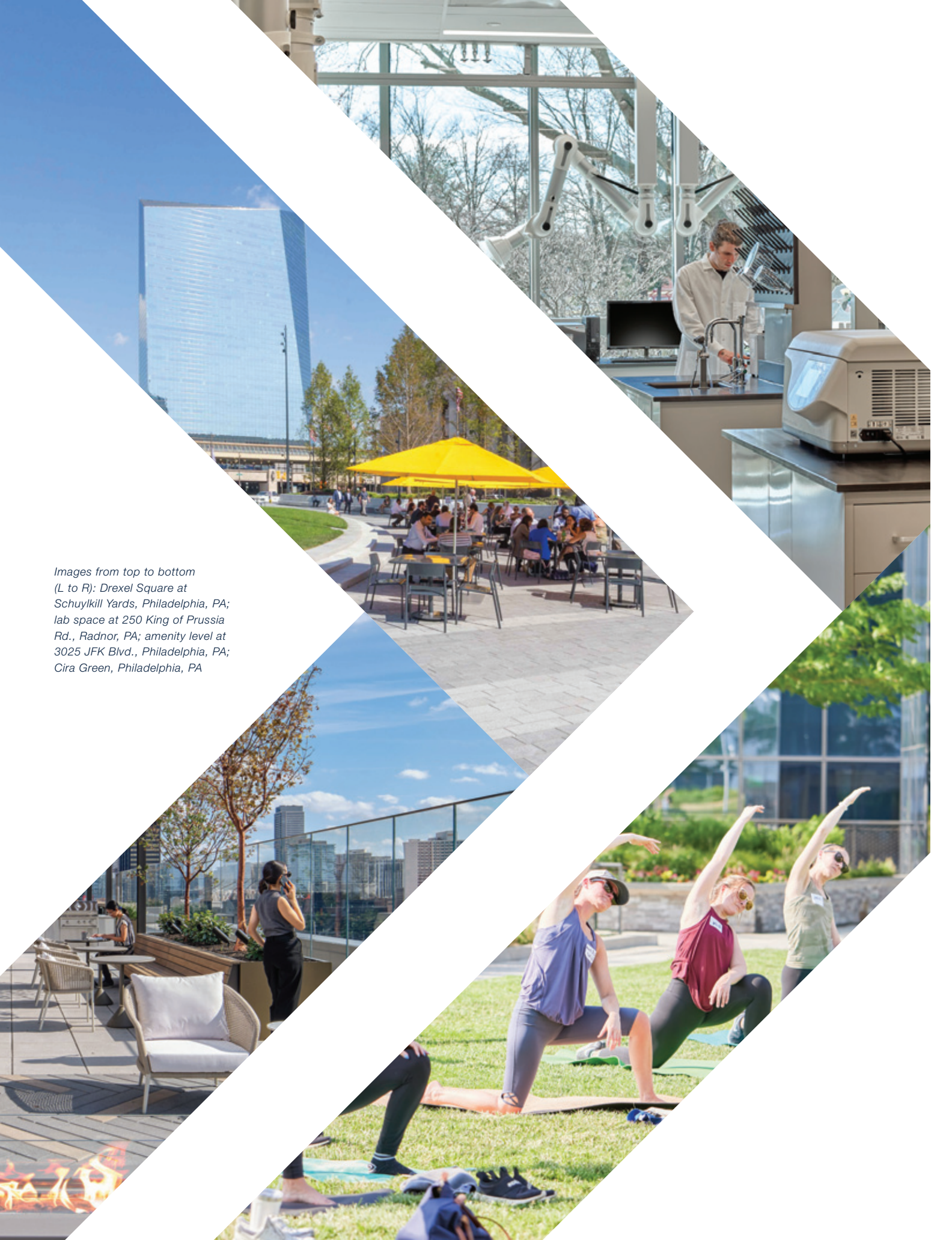
Images from top to bottom (L to R): Drexel Square at Schuylkill Yards, Philadelphia, PA; lab space at 250 King of Prussia Rd., Radnor, PA; amenity level at 3025 JFK Blvd., Philadelphia, PA; Cira Green, Philadelphia, PA